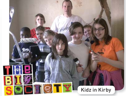
Kidz in Kirby