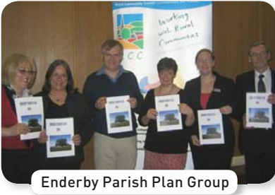
Enderby Parish Plan Group