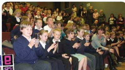
Young people using electronic hand sets

It is Blaby Together's belief that today's community leaders must work with young people who will one day form the next generation of Parish Councillors, Village Hall committee members,